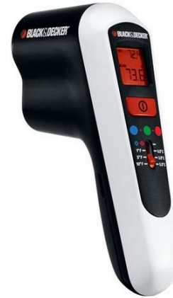
Thermal Leak Detector